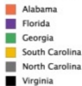
Black Belt Rural Persistent Poverty Counties by State

Persistent Rural Poverty is present when 20% or more of a county has lived below the federal poverty line for 30+ years. There are 301 counties of persistent rural poverty in the United States that have been identified by the U.S. Department of Agriculture. The number of counties listed above may change (and could potentially grow in number) based on the data received through the U.S. Census.