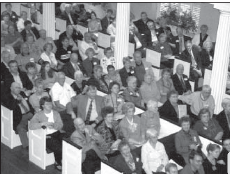
The sanctuary of The Baptist Church of Beaufort was packed for the Friday night service.