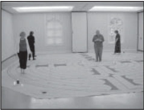
Walking the labyrinth, a tool for contemplative prayer, one of the options at the General Assembly.