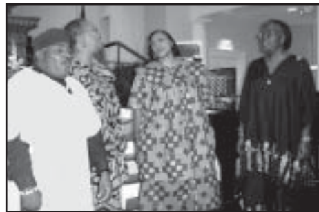
Fellowship Concert Choir of Beaufort.