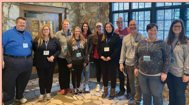
A few of the CBFSC ministers at the Oasis retreat.

Youth, children, and college ministers have had to be creative, innovative, and flexible over the past few years, and this has been exhausting. At the Oasis retreat, ministers were able to fellowship with one another, relate to similar experiences, discuss ideas, relax, and rest. We are appreciative to the organizers of this event and are thankful for the participation of all who attended.